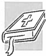
TABLE OF THE WORD FOR JULY 23, 2017 SIXTEENTH SUNDAY IN ORDINARY TIME

FIRST READING (Wisdom 12.13, 16-19): You give repentance for sins. This passage from the Book of Wisdom is addressed directly to God. We can sense the wonder of the inspired writer, who recognizes that God's power is seen most clearly in God's gentleness and mercy. And God's people must strive to become more like God – our justice, too, must be joined with great kindness.