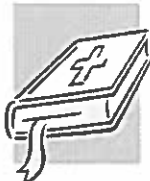
TABLE OF THE WORD FOR JULY 9, 2017 FOURTEENTH SUNDAY IN ORDINARY TIME

FIRST READING (Zechariah 9.9-10): Lo, your king comes to you, humble and riding on a donkey. Zechariah proclaims the coming of the Messiah in striking imagery. The king will not come on a warhorse, with a display of military might, but meekly, on a beast of burden. And yet, his power is beyond question, as he sweeps away chariots, horses, and weapons of war, and proclaims peace to the whole earth.