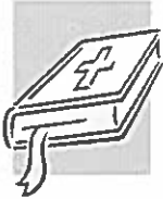
TABLE OF THE WORD FOR JULY 16, 2017 FIFTEENTH SUNDAY IN ORDINARY TIME

FIRST READING (Isaiah 55.10-11): The rain makes the earth bring forth and sprout. This wonderful passage from Isaiah about the power of God's Word is also heard at the Easter Vigil. When the rain and snow fall to the earth, they make something happen: plants and trees and all creatures live and grow. That is what God's Word is like: it is effective, making things grow and change in us, achieving what God wills.