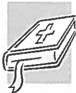
TABLE OF THE WORD FOR JUNE 11, 2017 THE SOLEMNITY OF THE MOST HOLY TRINITY

FIRST READING (Exodus 34.4b-6, 8-9): The Lord, a God merciful and gracious. Moses has begged to see the glory of God, and God grants his request. On Mount Sinai, God proclaims his name, and lets Moses glimpse his glory as he passes by. But most revealing of all is what God cries out about who God is: "merciful and gracious..." slow to anger and rich in kindness and fidelity." This solemnity does not explain God, but gives us a glimpse of God as a community of love and a fountain of mercy.